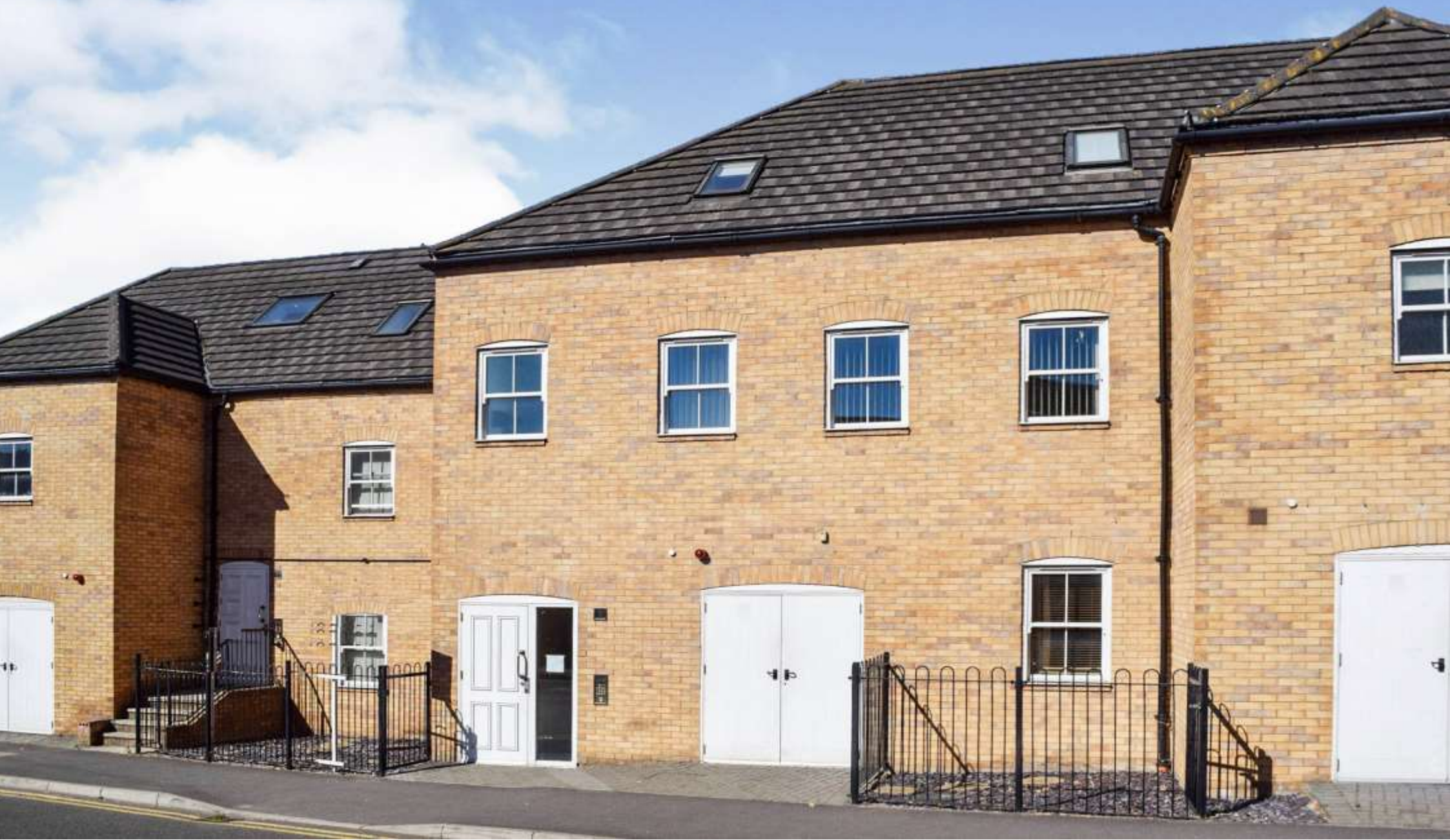
Church Street, Stanground Peterborough PE2 8GH