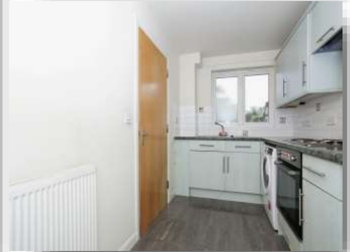
Oaklands, Peterborough PE1 2QY