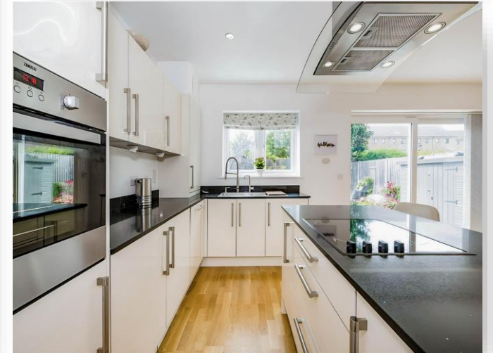
Cactus House Aldermans Drive, Peterborough PE3 6AR