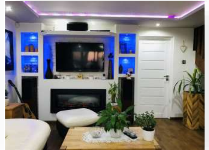
Dorchester Crescent, Peterborough PE1 4RP