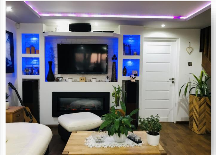
Dorchester Crescent, Peterborough PE1 4RP