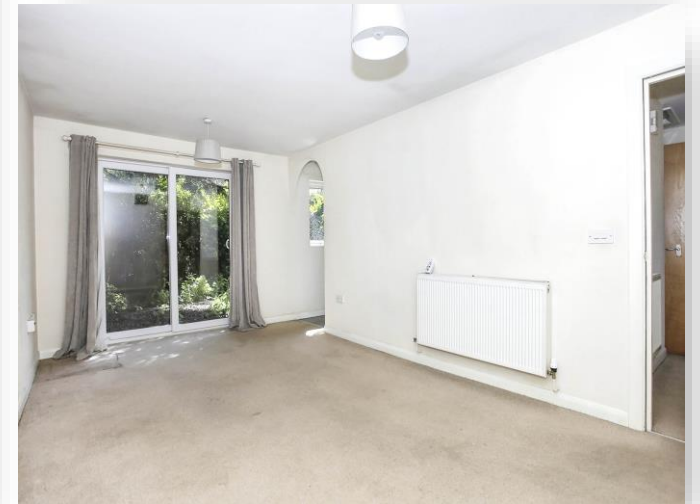
Oaklands, Peterborough PE1 2QY