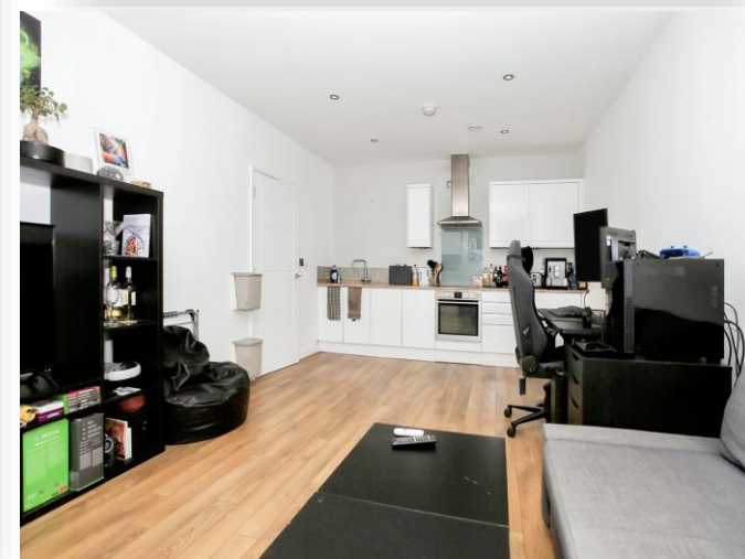
Cathedral View Wentworth Street, Peterborough PE1 1DS