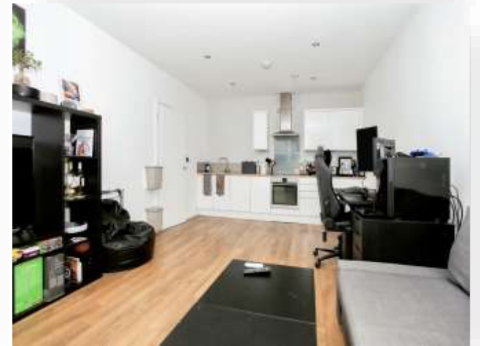
Cathedral View Wentworth Street, Peterborough PE1 1DS