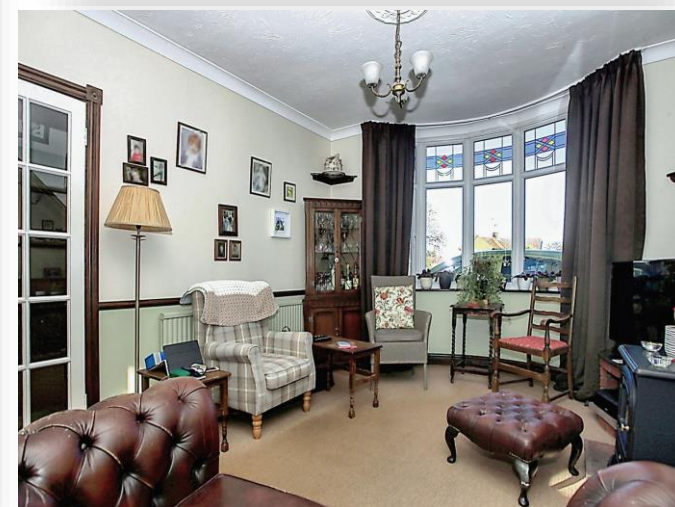
Newark Avenue, Peterborough PE1 4NH