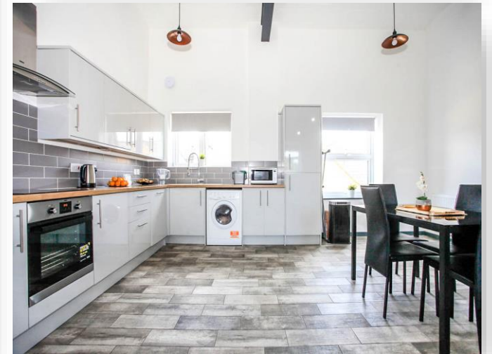
Crawthorne Street, Peterborough PE1 4AD