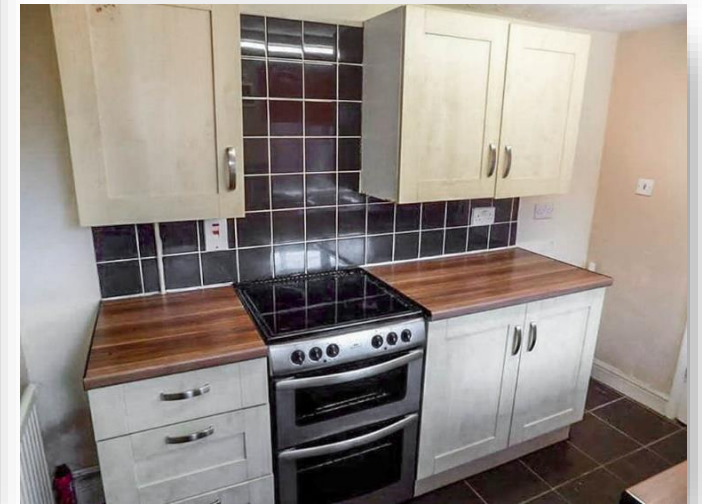
Crown Street, Peterborough PE1 3HX