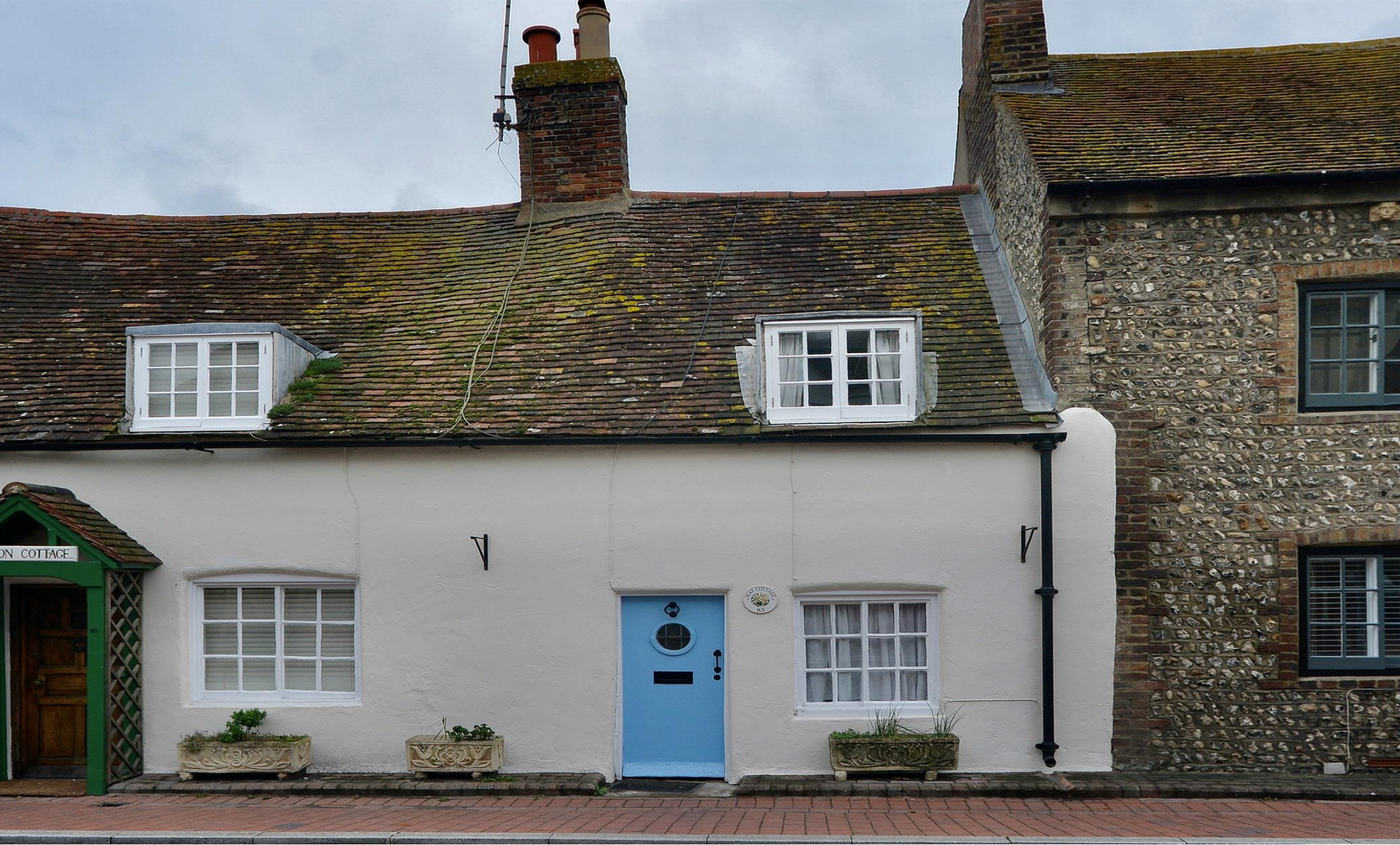
May Cottage, High Street, Rottingdean, Brighton, BN2 7HE