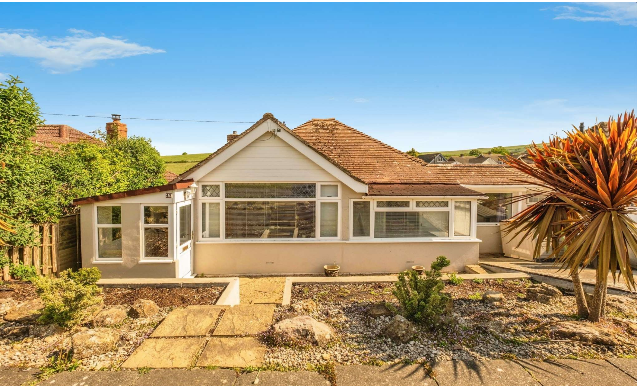
Westfield Avenue North, Saltdean Brighton BN2 8HS