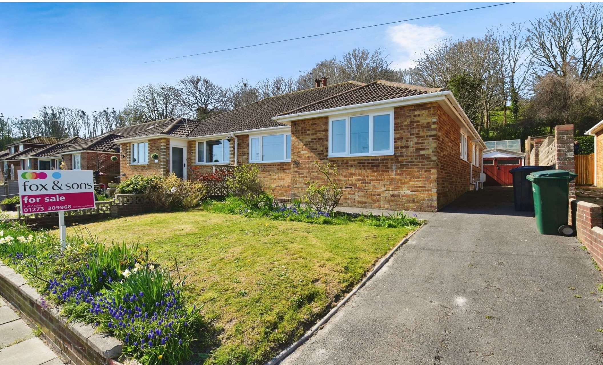
Elvin Crescent, Rottingdean Brighton BN2 7FF