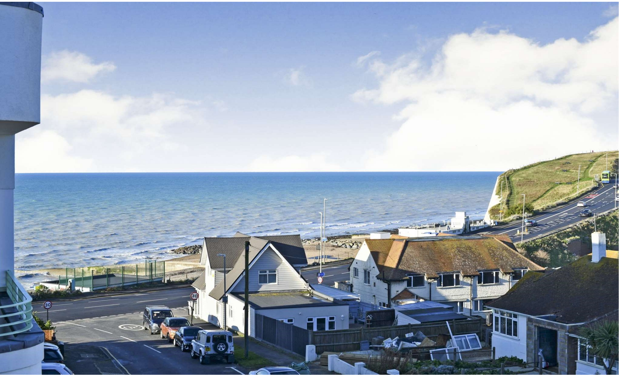
Rowanden Court Chichester Drive East, Saltdean Brighton BN2 8LW

Not for marketing purposes INTERNAL USE ONLY