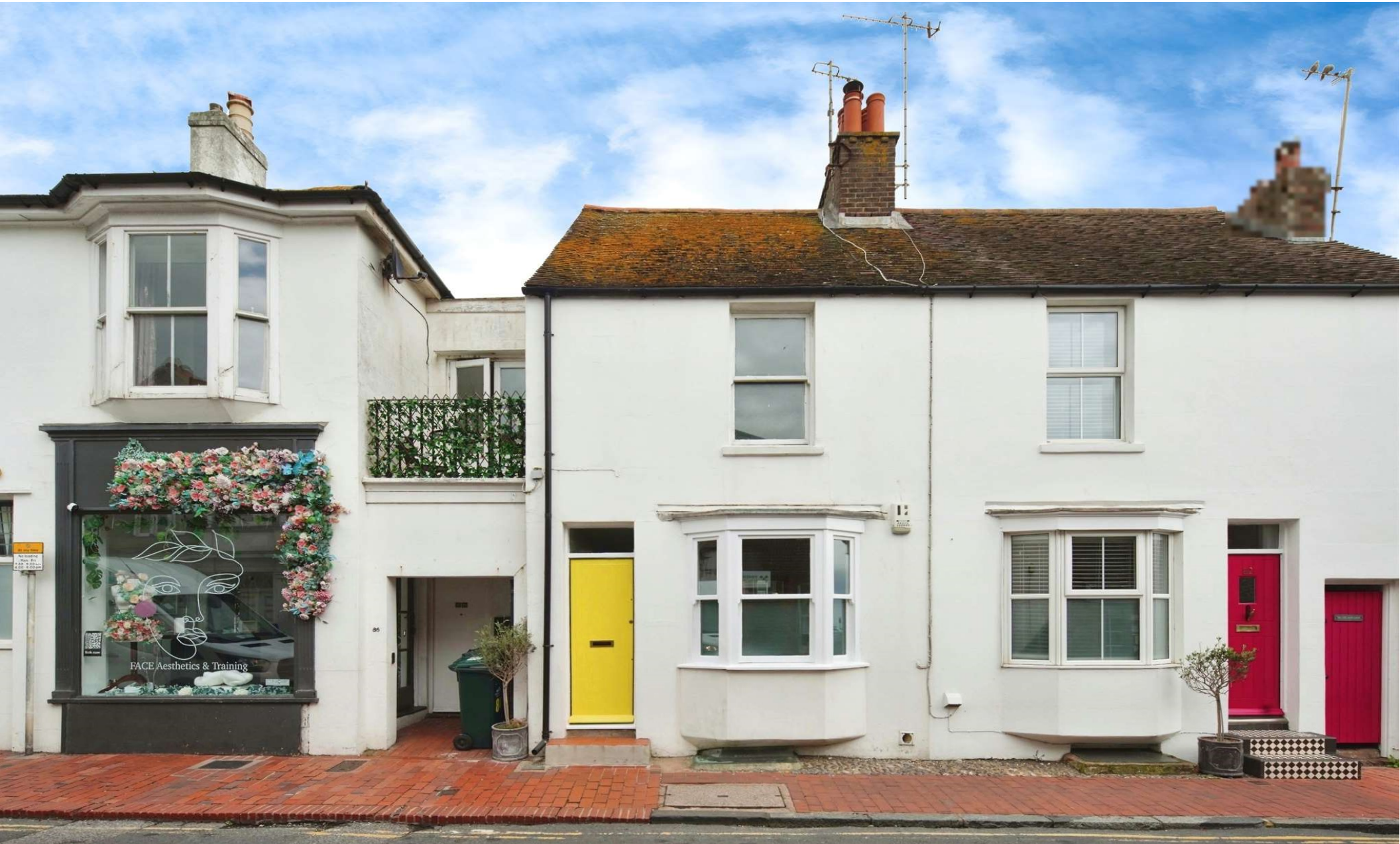
High Street, Rottingdean Brighton BN2 7HF