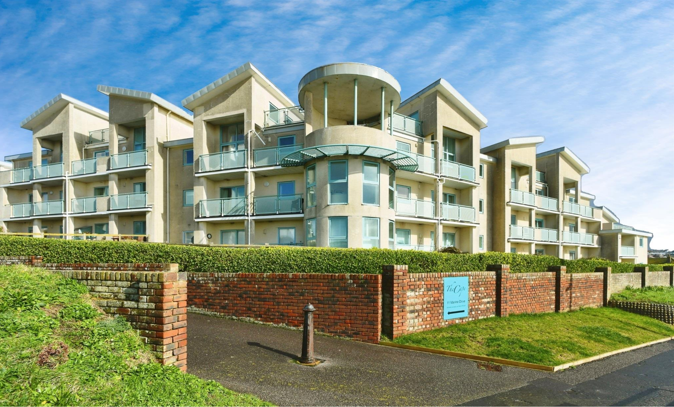
The Cape, Marine Drive, Rottingdean, Brighton, BN2 7GZ