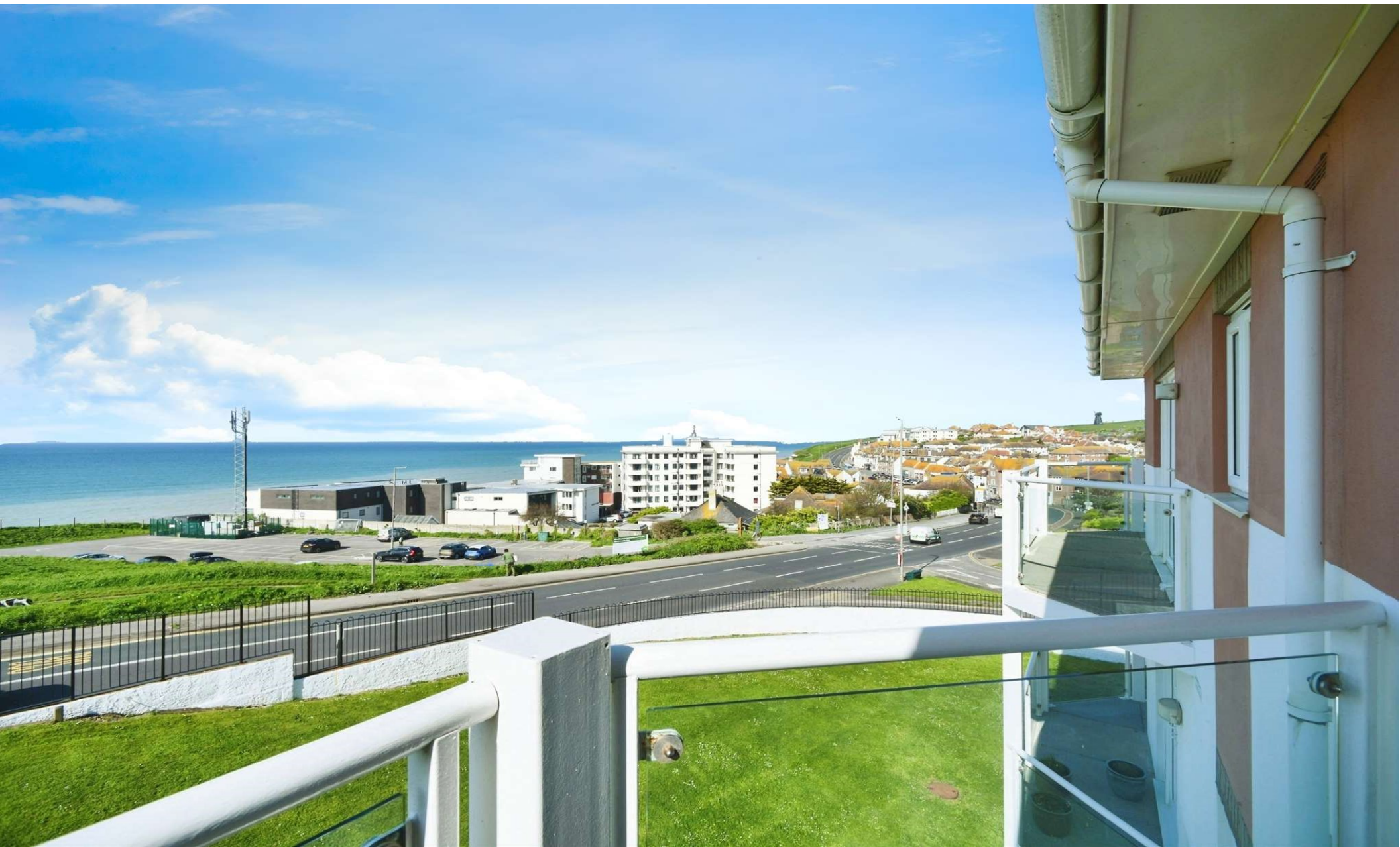
Ocean Reach Newlands Road, Rottingdean Brighton BN2 7GD