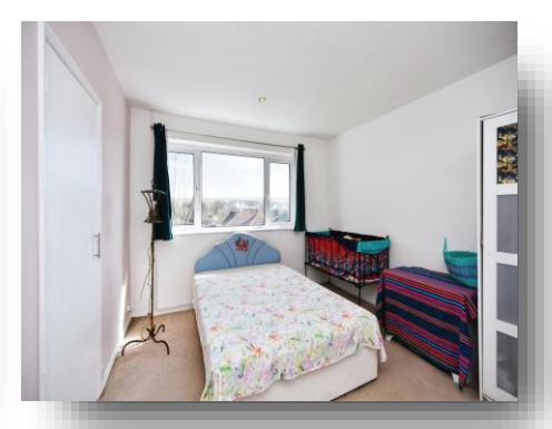
Cissbury Cres Brambletyne Ave Hamsey Rd