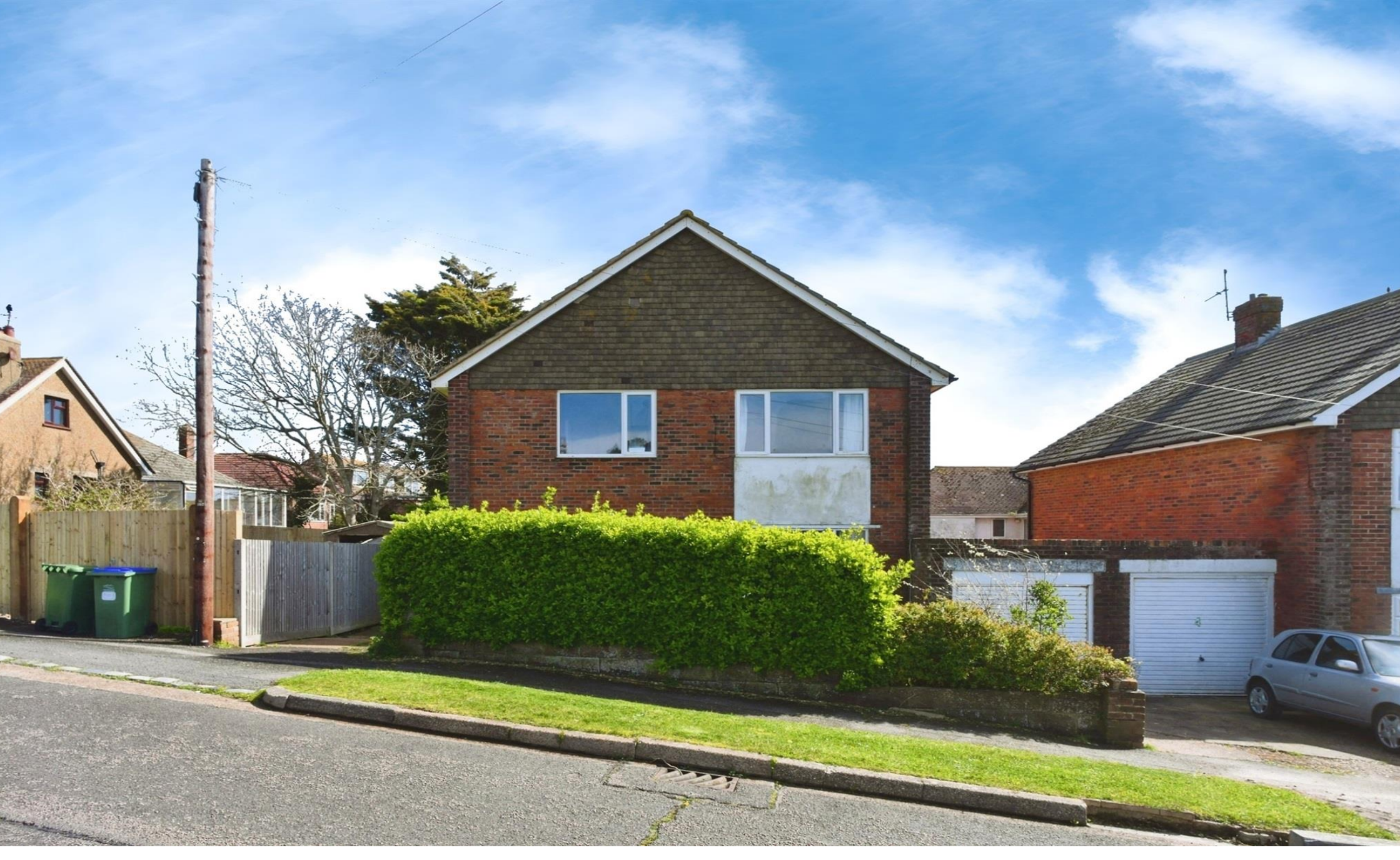
Brambletyne Avenue, Saltdean, Brighton, BN2 8EL