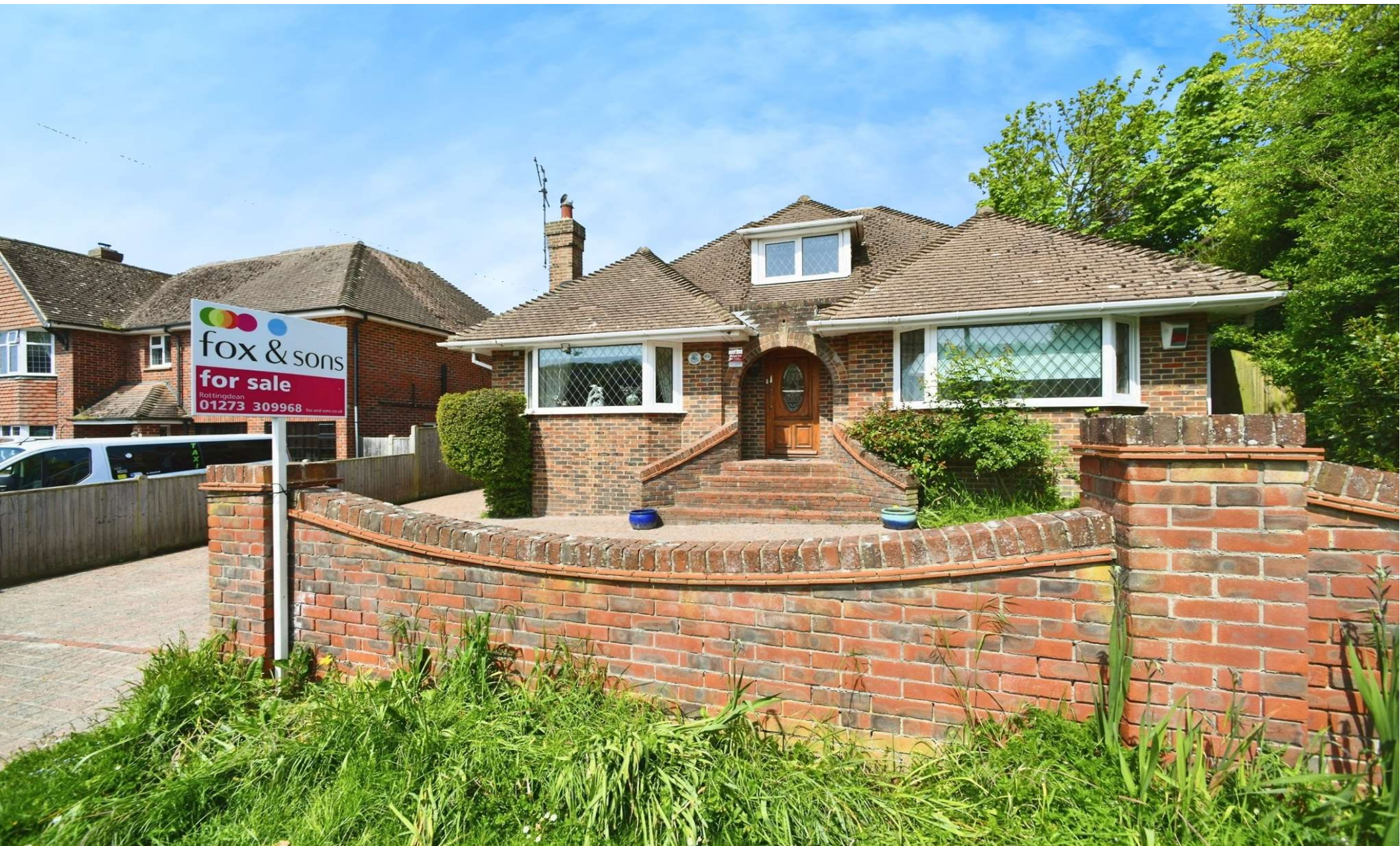
Dean Court Road, Rottingdean Brighton BN2 7DL