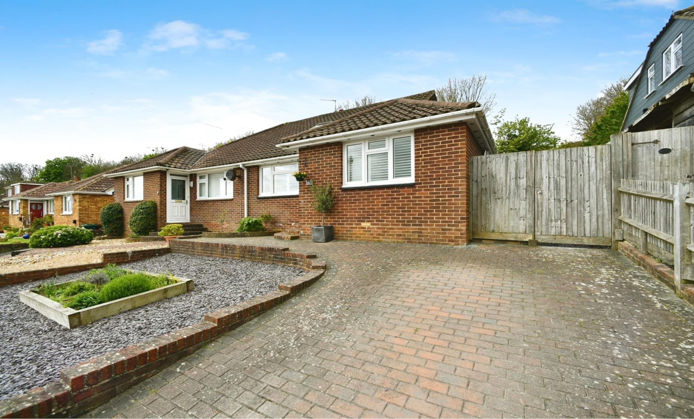
Elvin Crescent, Rottingdean, Brighton, BN2 7FF