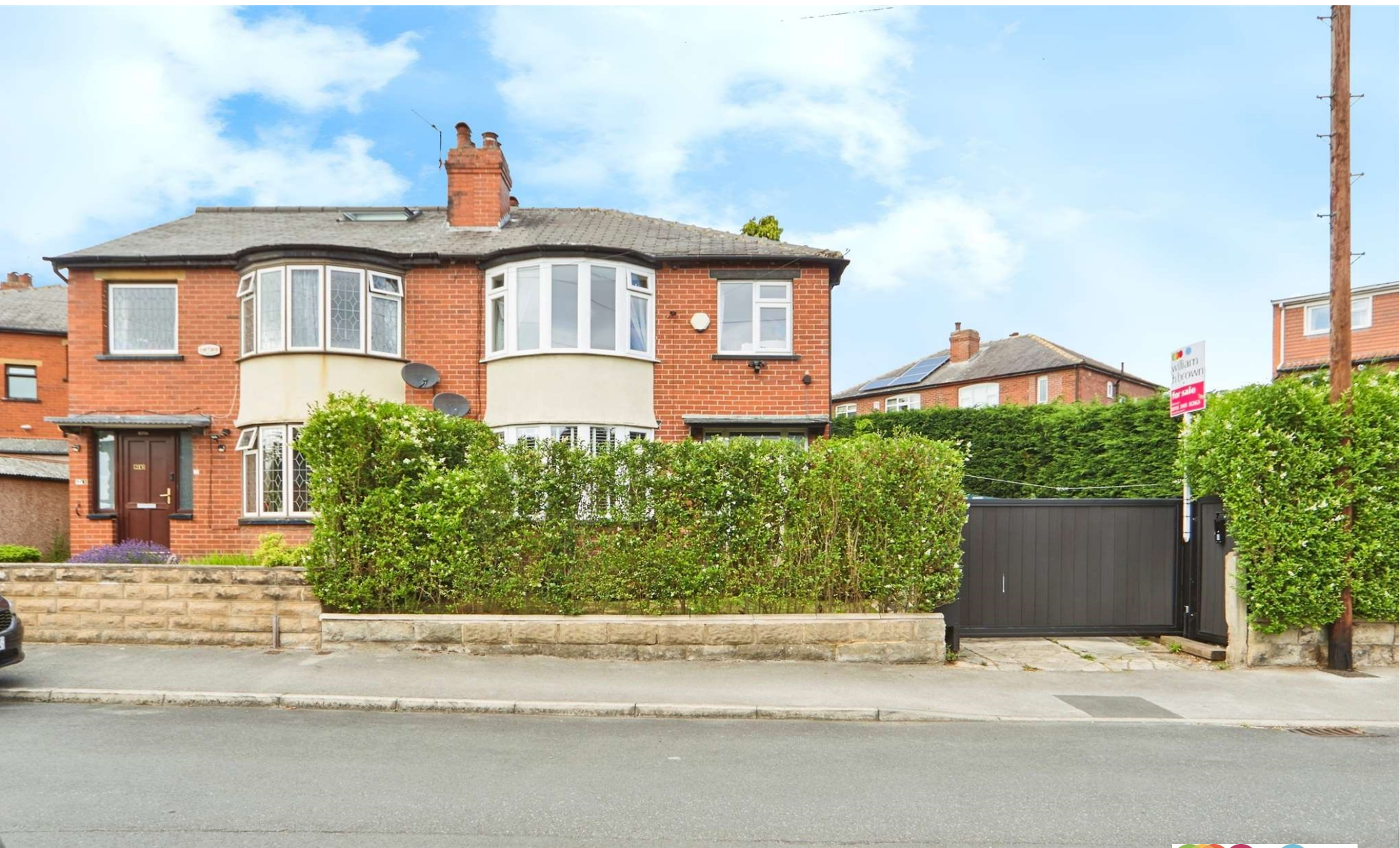
Montagu Gardens, Leeds LS8 2RN