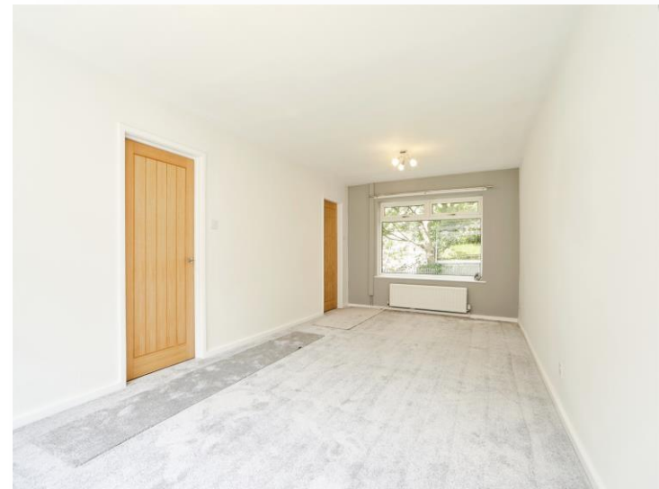
Chandos Walk, LEEDS LS8 1QD