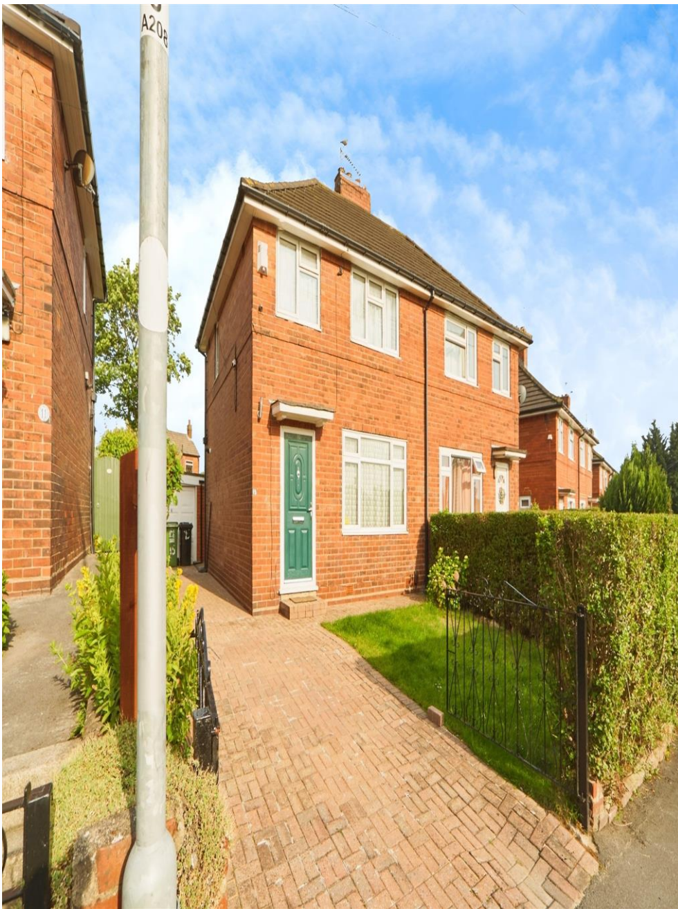
Amberton Mount, LEEDS LS8 3JG