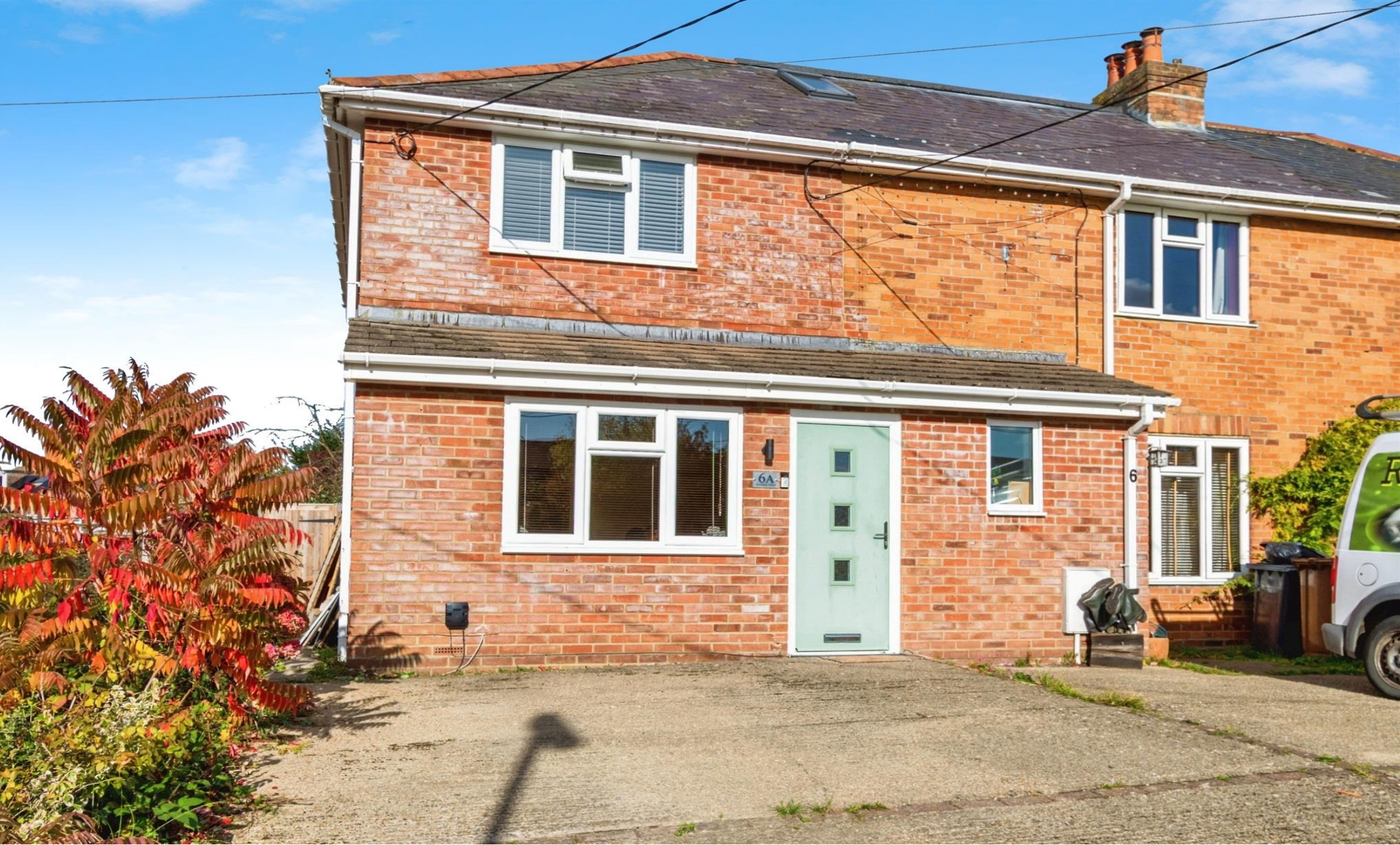
Nursling Street Cottages, Nursling Street, Nursling, SO16 0XH