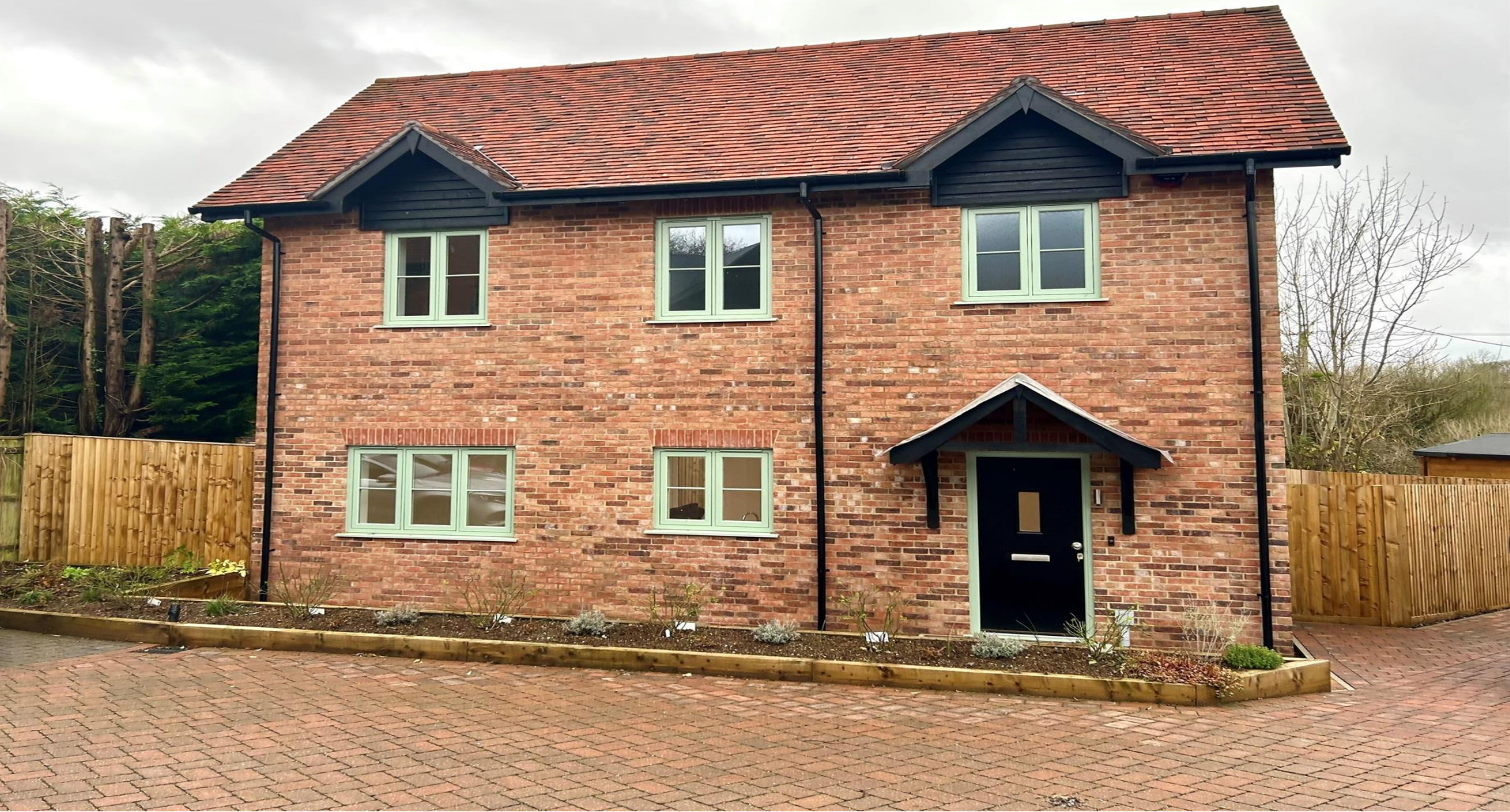
Home Farm, Embley Lane, East Wellow, Romsey, SO51 6DN