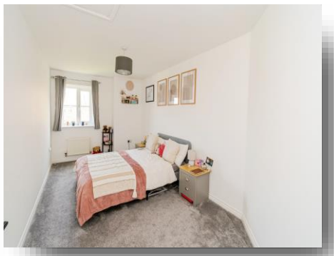
view this property online fox-and-sons.co.uk/Property/RMY105367