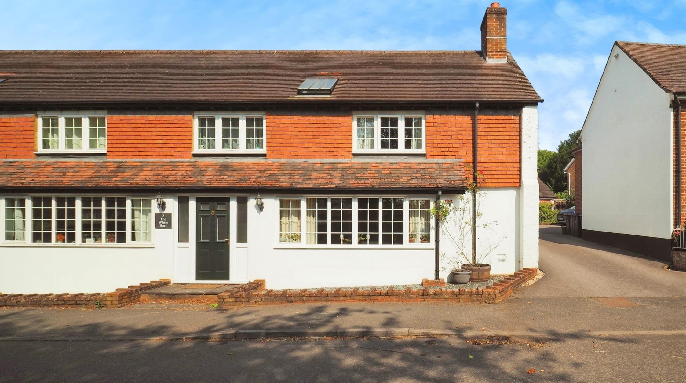
The White Hart, Romsey Road, Whiteparish, Salisbury, SP5 2RG