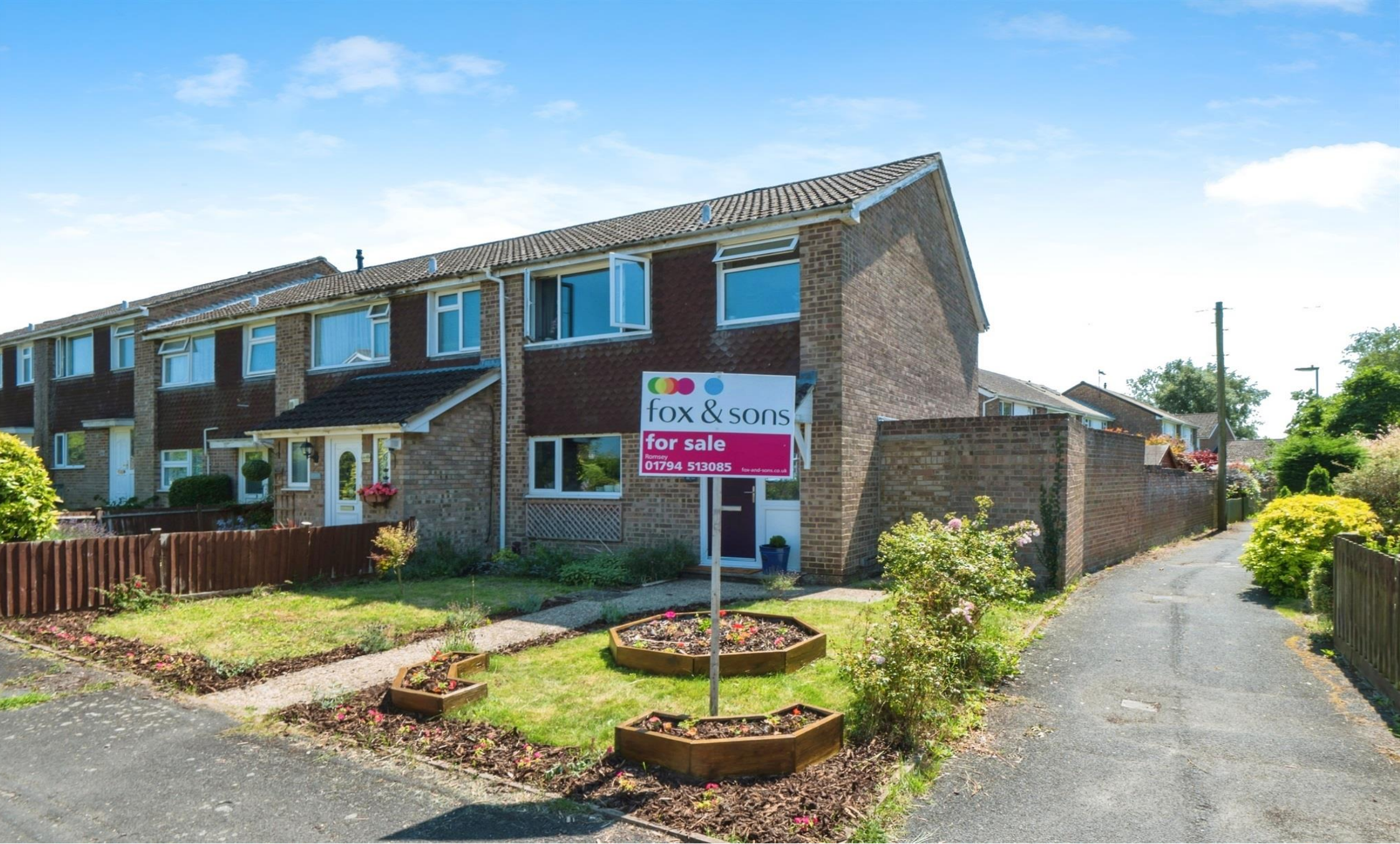
Stapleford Close, Romsey, SO51 7HU