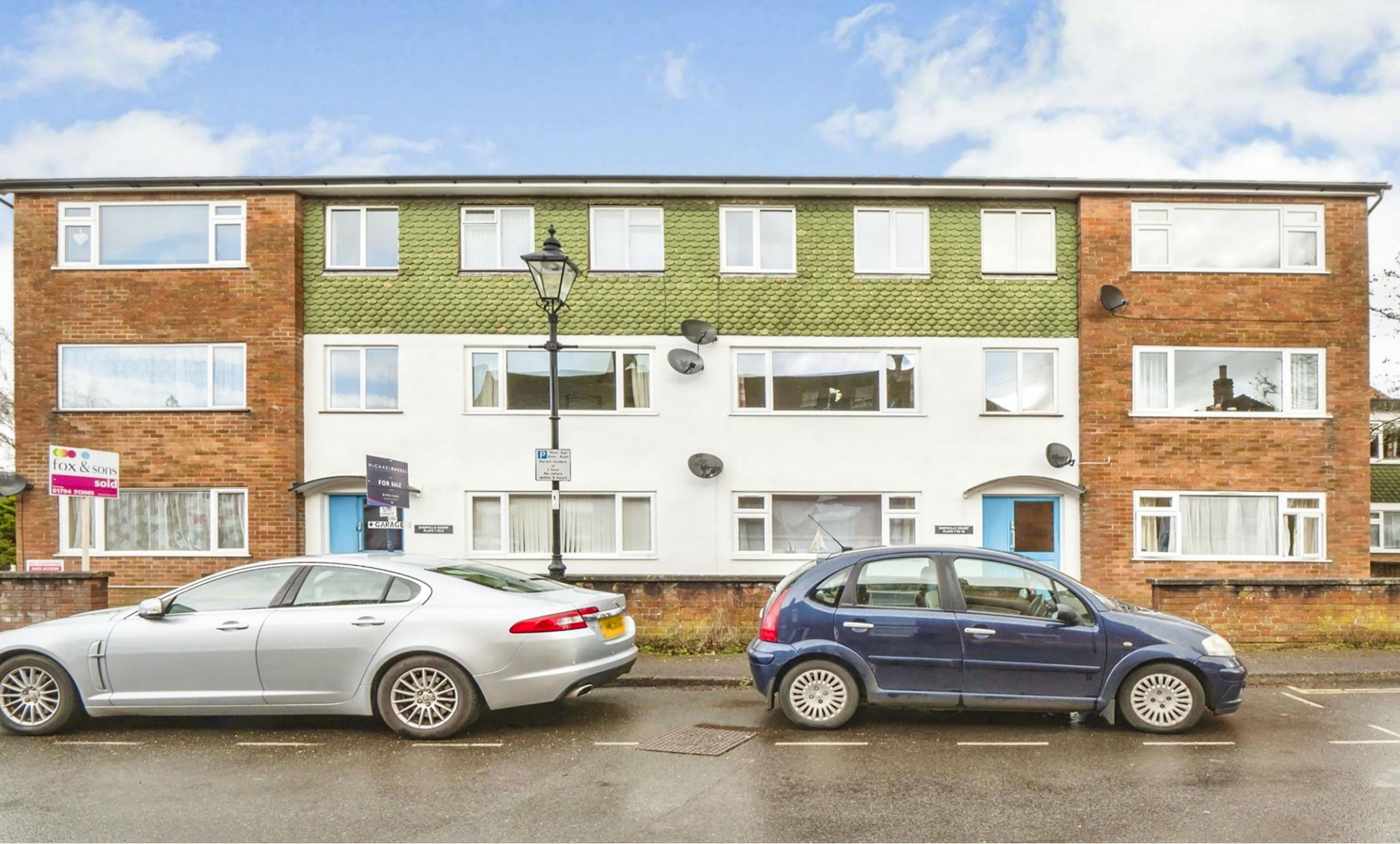
Cherville Court, Mill Lane, Romsey, SO51 8EX