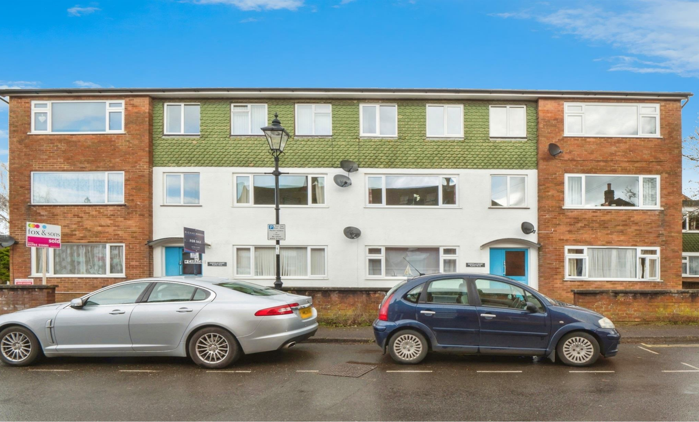
Cherville Court, Mill Lane, Romsey, SO51 8EX