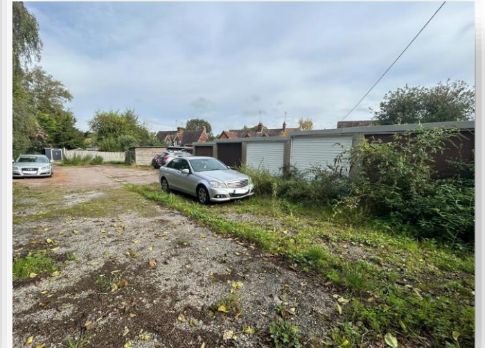
Church Road, Kings Somborne, Stockbridge, SO20 6NU