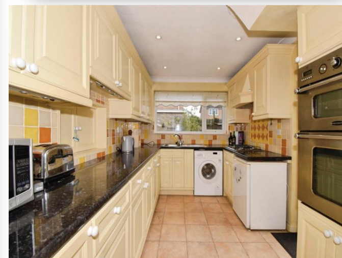
Trent Close, Oadby Leicester LE2 4GP