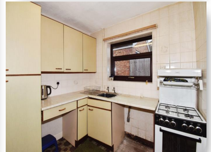
Foxhunter Drive, Oadby Leicester LE2 5FG