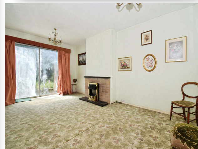
Brambling Way, Oadby Leicester LE2 5PA