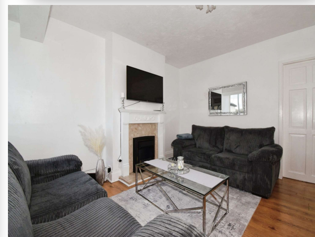
Grange Drive, Glen Parva Leicester LE2 9PH