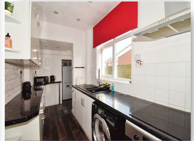
Little Glen Road, Glen Parva Leicester LE2 9TT