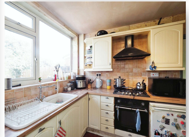
Greenbank Drive, Oadby Leicester LE2 5RP