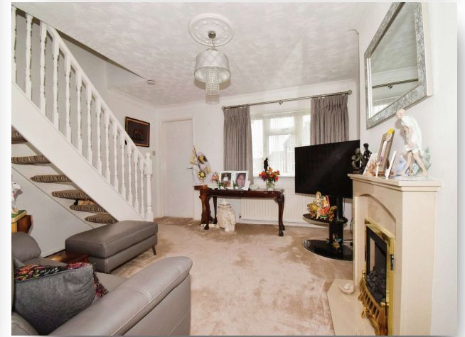
Wilton Close, Oadby Leicester LE2 4ST