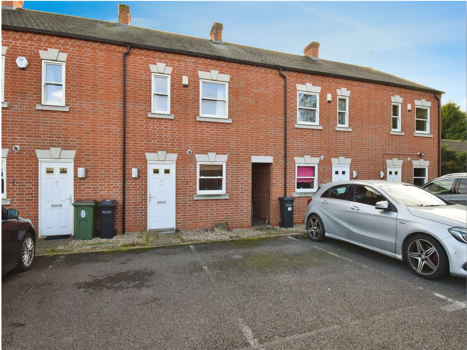
Onderby Mews, Oadby Leicester LE2 5AU