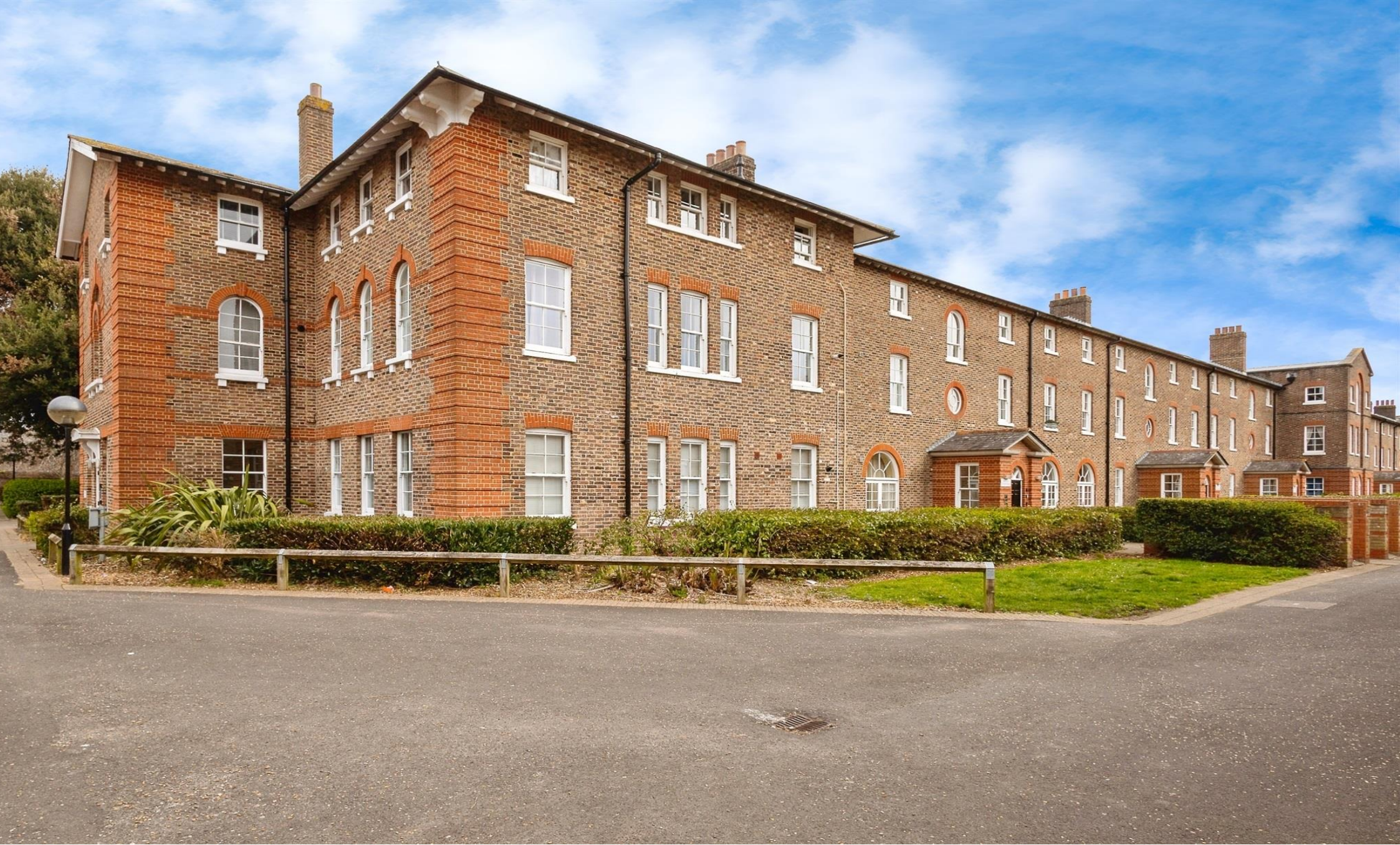
St Marys House St. Marys Road, Portsmouth PO3 6AB