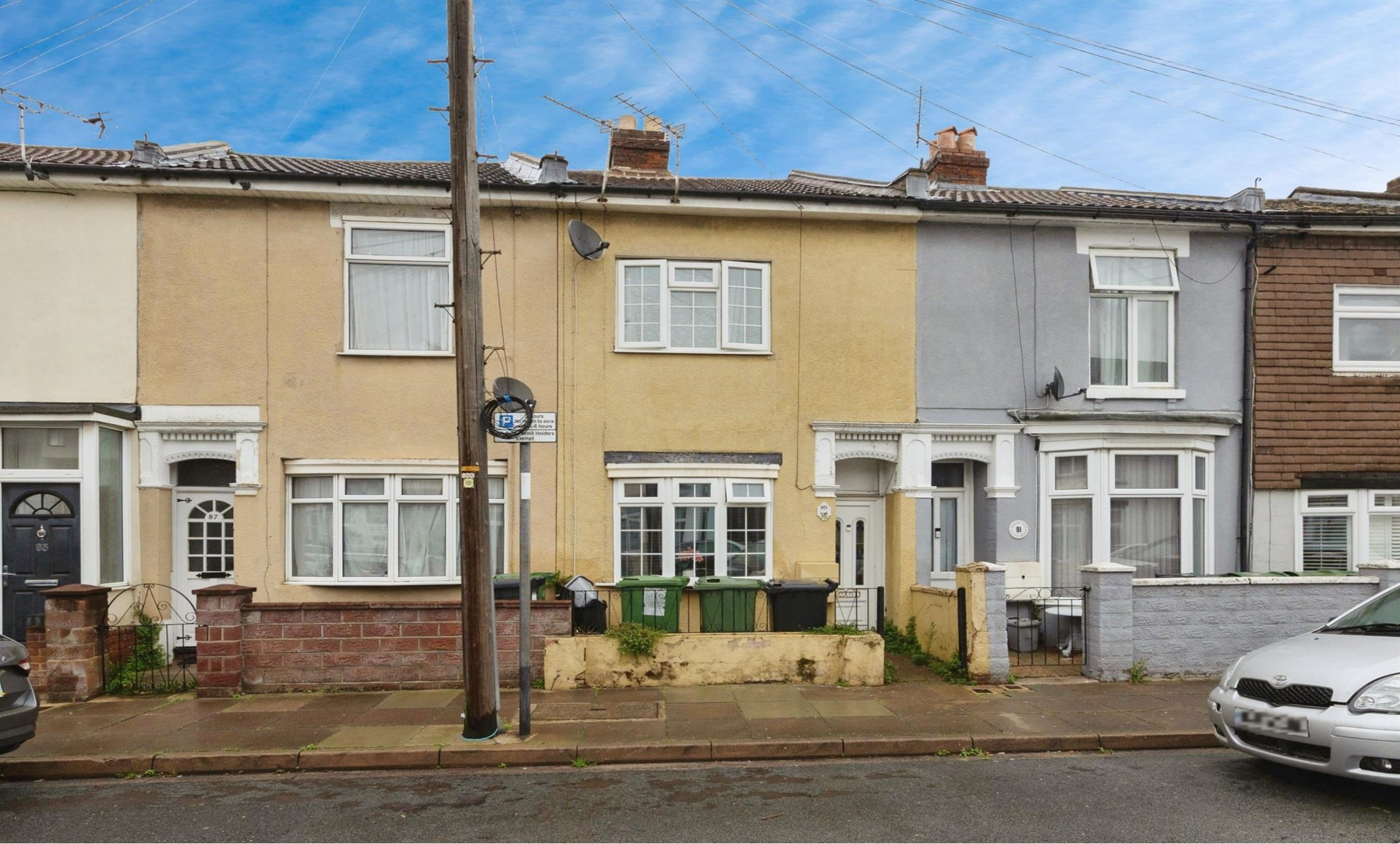
Clive Road, Portsmouth PO1 5JB