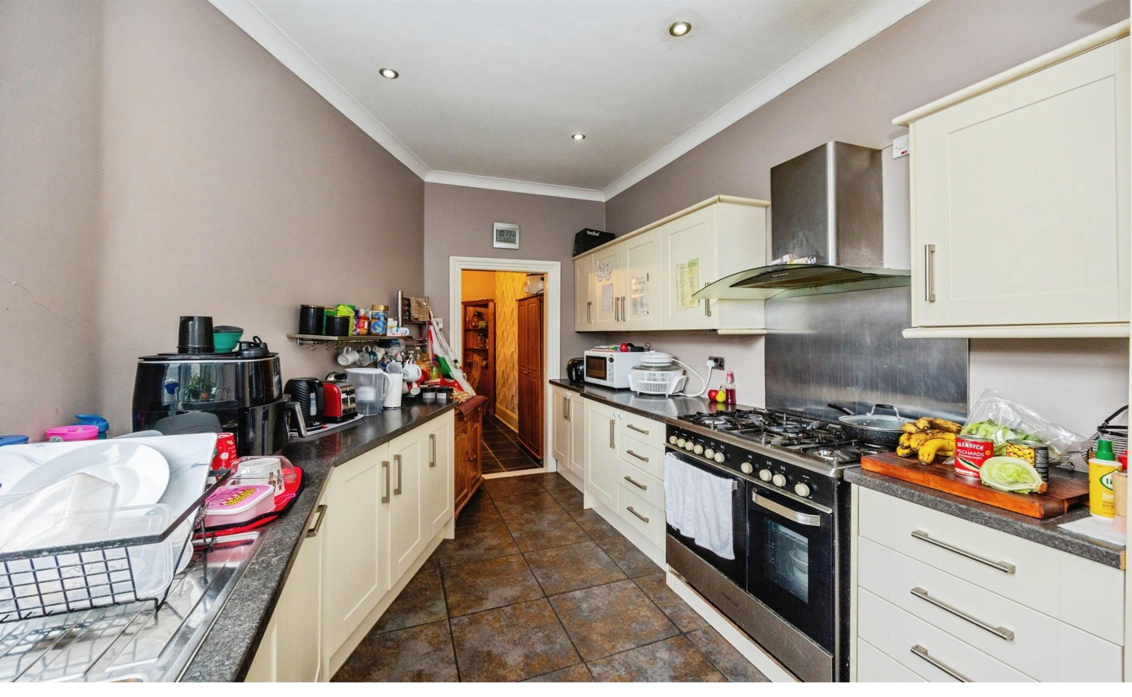
Gladys Avenue, Portsmouth PO2 9BH