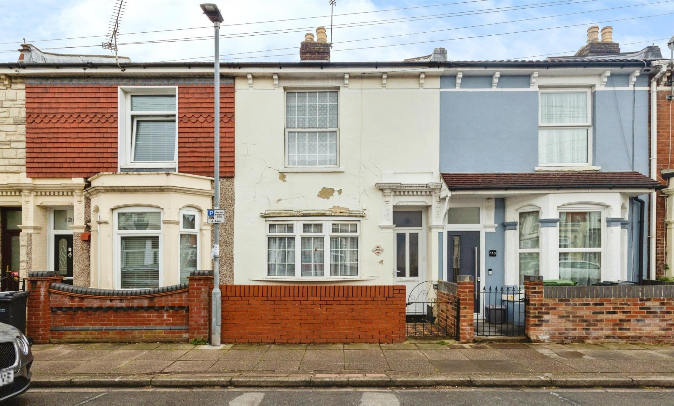
Shearer Road, Portsmouth PO1 5LR