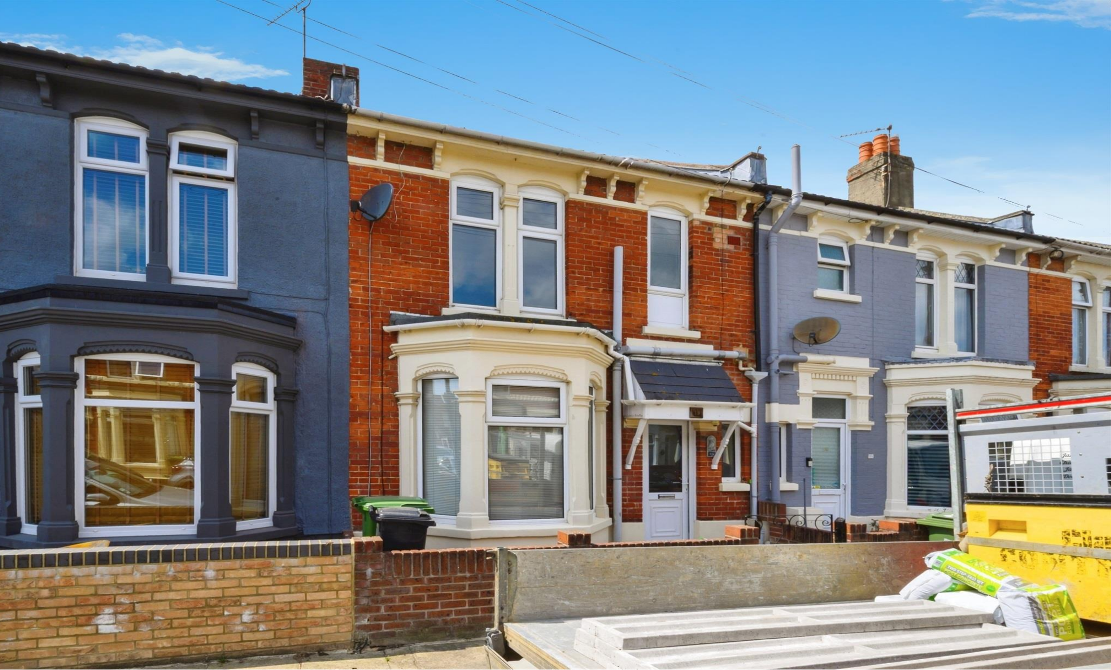
Balfour Road, Portsmouth PO2 0DH