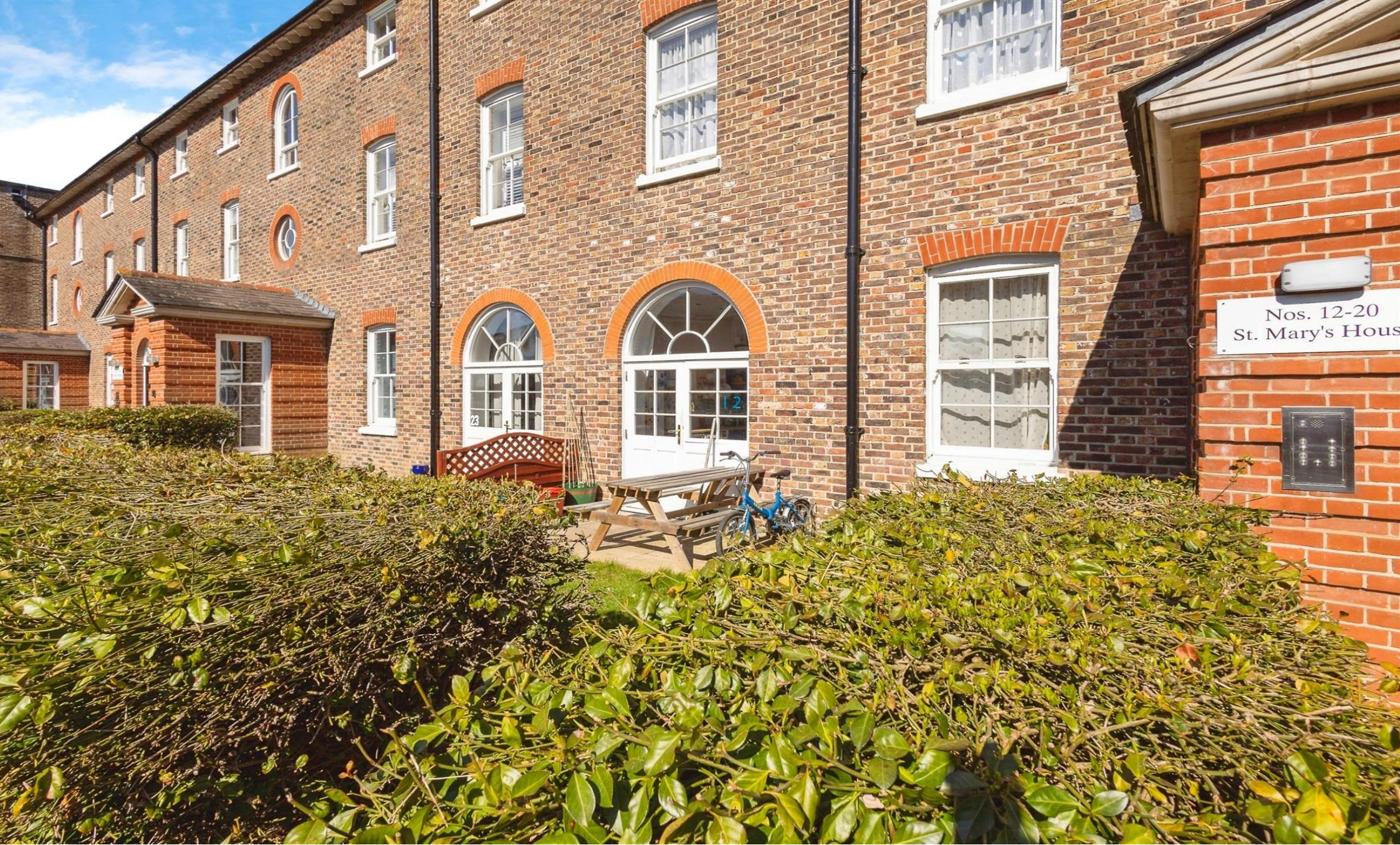
St. Marys House St. Marys Road, PORTSMOUTH PO3 6AB