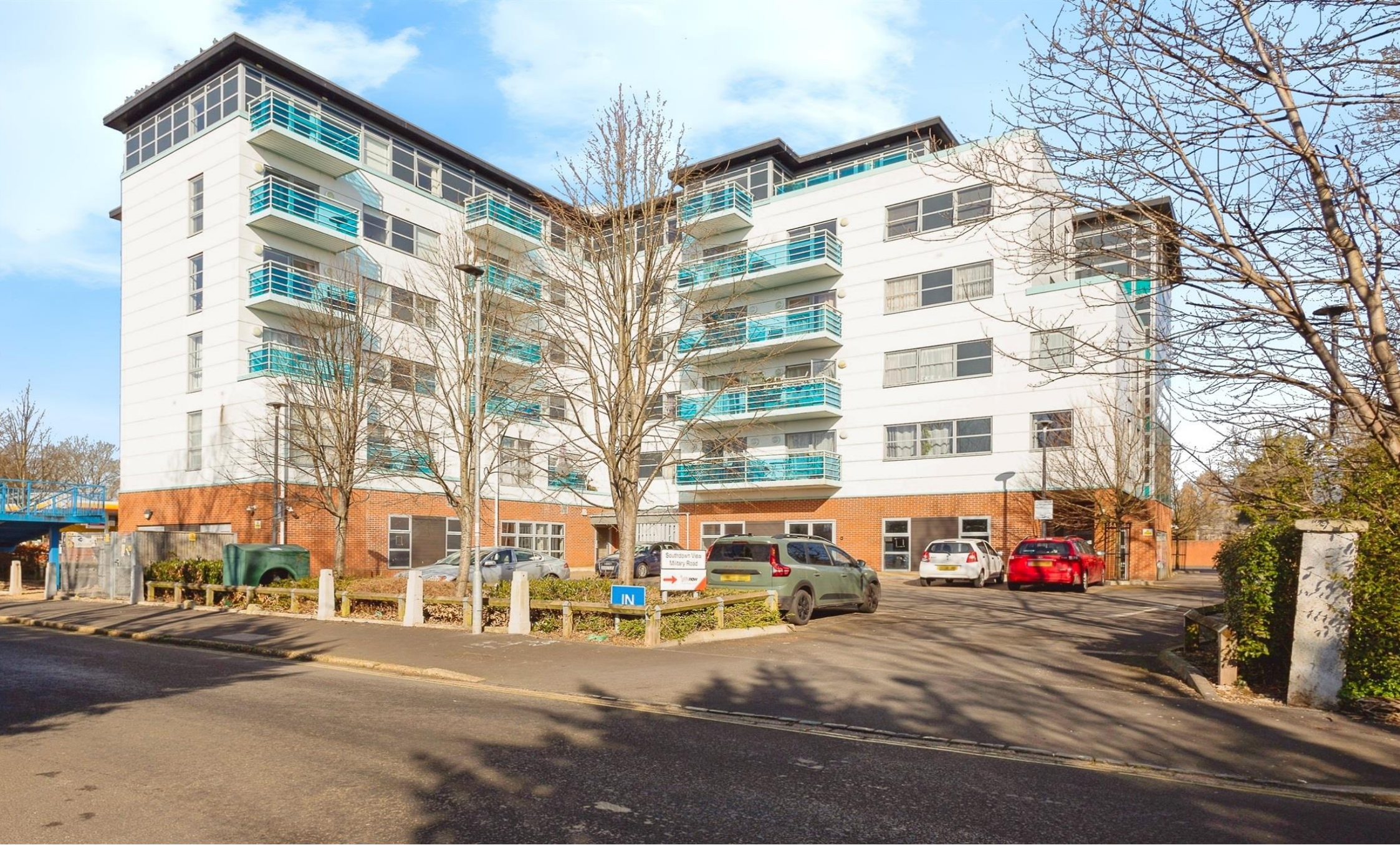
Southdown View Military Road, Hilsea Portsmouth PO3 5FS