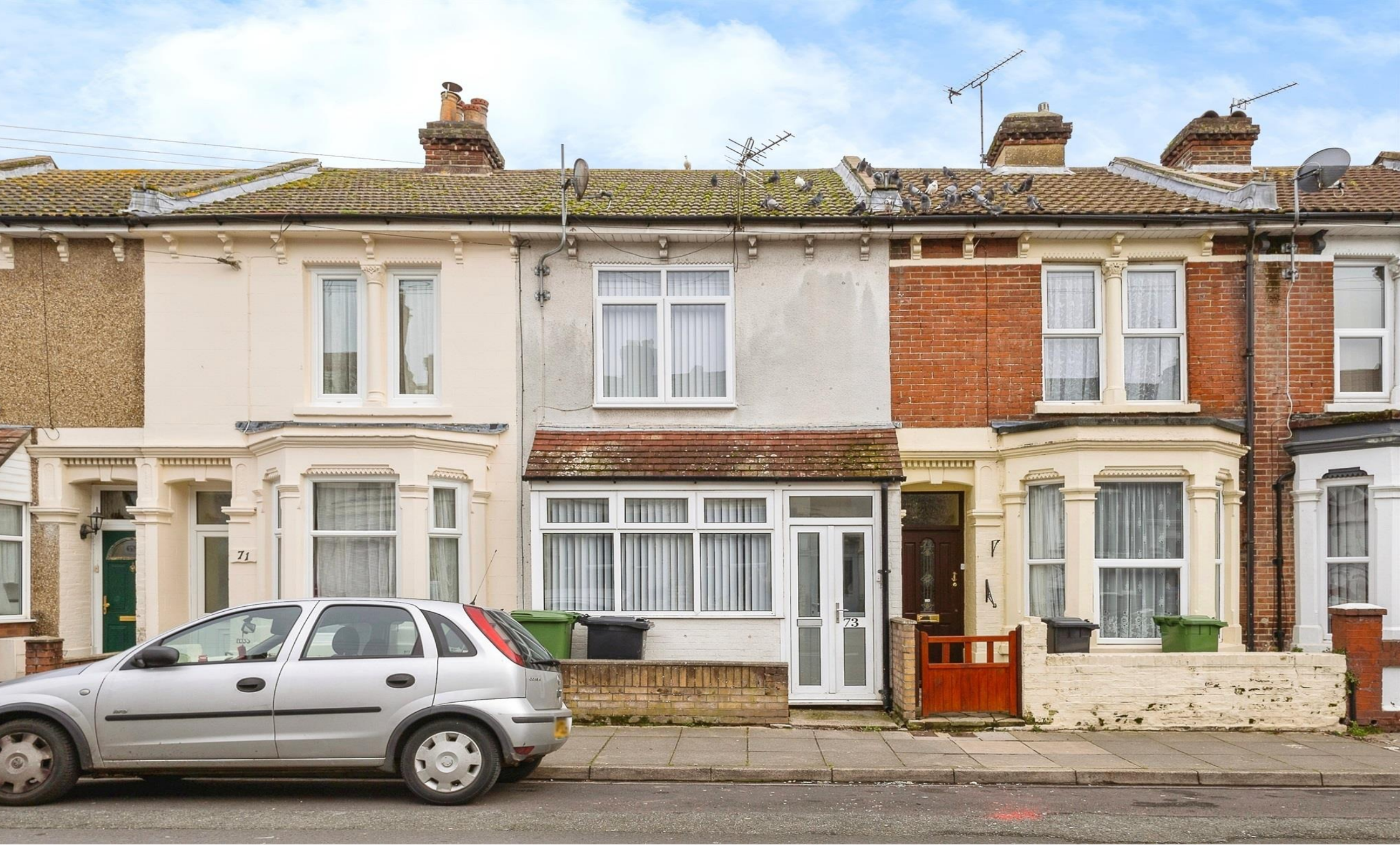
Ernest Road, PORTSMOUTH PO1 5RD