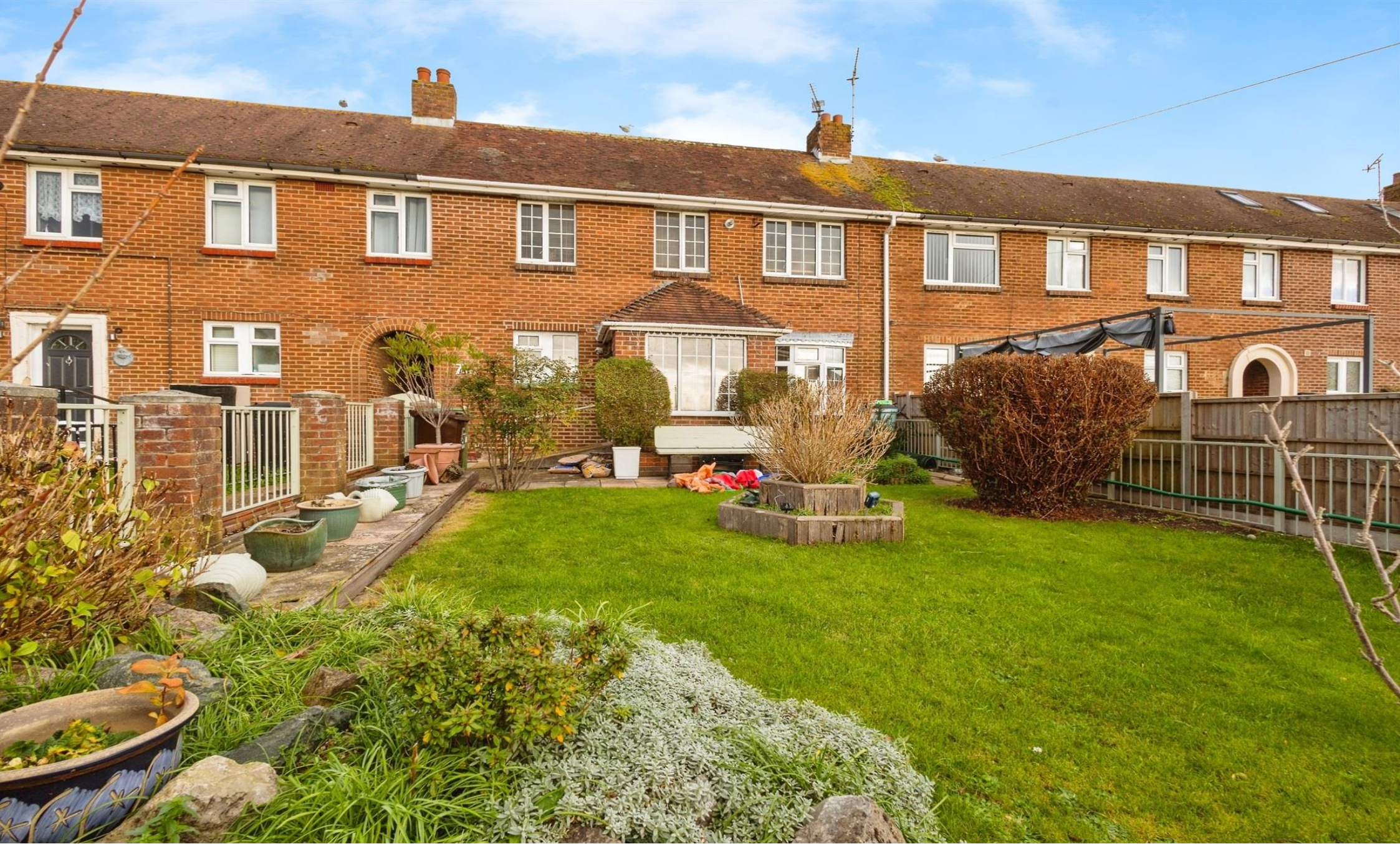
Holbeach Close, Portsmouth PO6 3LD