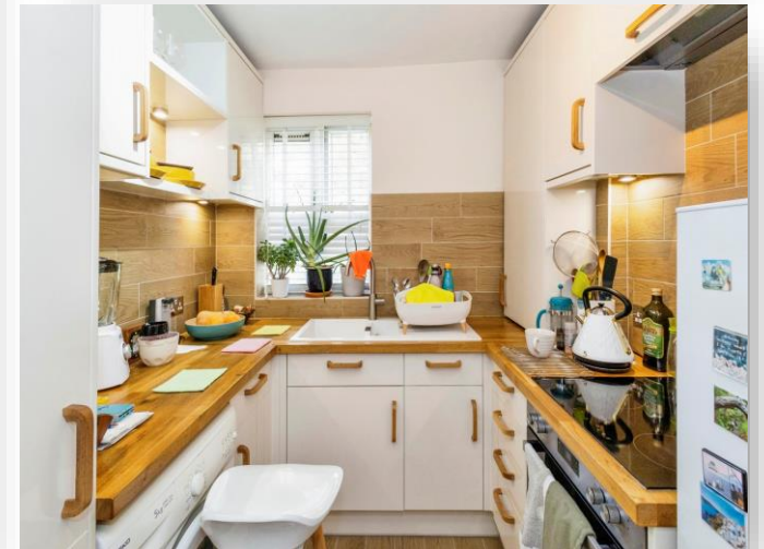
Childe Square, Portsmouth PO2 8PL